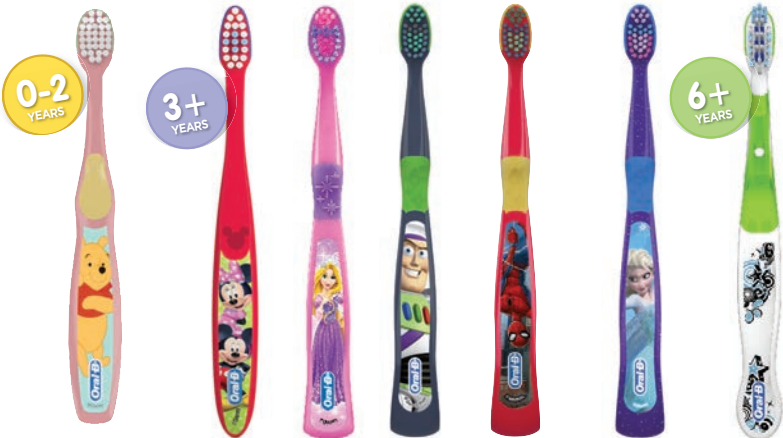
Disney® Winnie the Pooh or Tigger